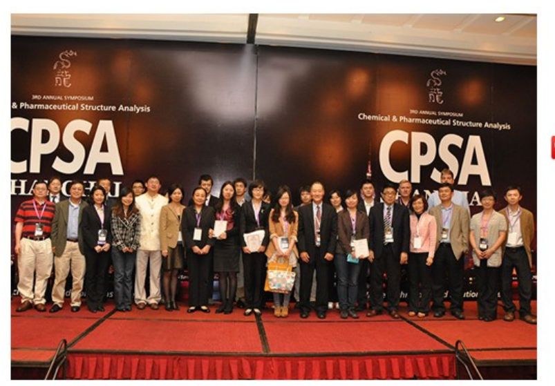
2012 Young Scientist Excellence Award recipients

For more information of the CPSA Shanghai 2013 event, please visit: <a href="http://www.cpsa-shanghai.com">http://www.cpsa-shanghai.com</a>.