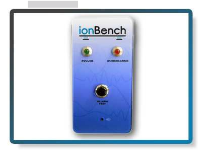
Overheating temperature alarm

In case of air intake or air exhaust obstruction, the air inside the noise enclosure could exceed the limits set by vacuum pump manufacturers for the pump operation at best capacity.