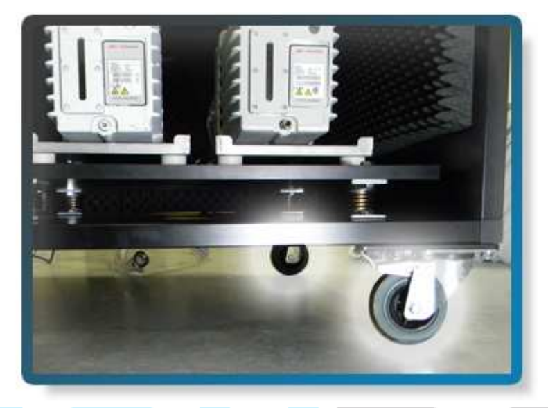
Fully movable bench

Fully movable bench with a weight capacity above 440 kg / 970 lbs and Chemical resistant worksurface for laboratory applications. Different bench sizes available depending the configuration of the LC/GC/MS. Black steel powder coated frame.